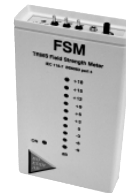
Field Strength Meter FSM