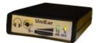
Loop receiver UniEar