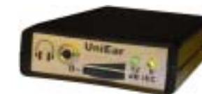
Loop receiver UniEar