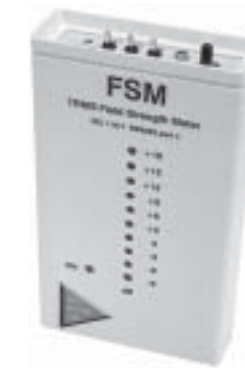
Field Strength Meter FSM